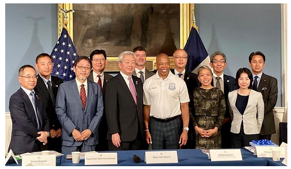
Mayor Adams (front row, 3rd from right) and the members of the delegation

that Japanese companies can make substantial contributions to addressing the various challenges faced by the city, including infrastructure maintenance, public safety, and environmental concerns. Both sides reaffirmed their commitment to strengthening the economic and cultural partnership.