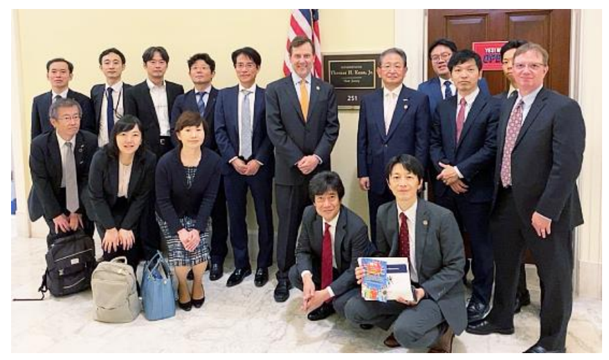
Representative Kean (center) and the members of the delegation

In Washington, the delegation held meetings with representatives from the Department of Commerce and the National Security Council, along with Representative Thomas Kean Jr. (R-New Jersey), a member of the House Science, Space and Technology Committee. These meetings primarily focused on discussions related to the Bold Goals for U.S. Biotechnology and Biomanufacturing, a White House initiative released in March. The U.S. counterparts emphasized the importance of international cooperation in bolstering biotechnology supply chains for enhanced resilience, particularly from an economic security perspective. They also expressed their expectations for increased investments and